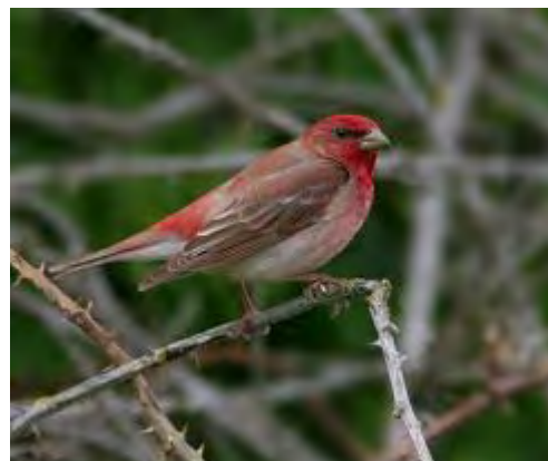
Scarlet Rosefinch