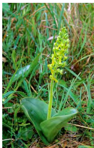
Common Twayblade