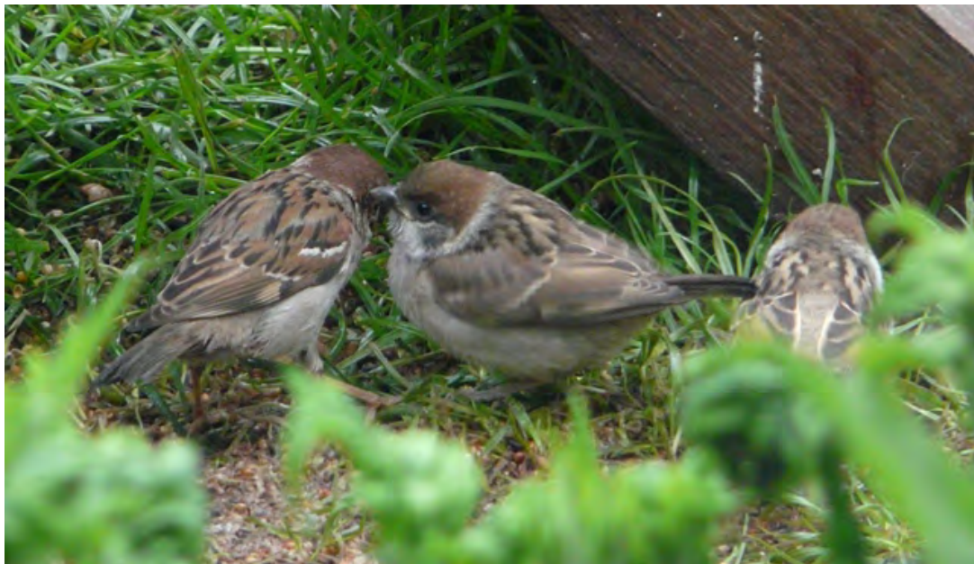
Above – A Tree Sparrow family below the garden bird table.

Speaking of which, I have at least three occupied nest boxes with some birds on to second broods now, a great result, when only three years ago, the birds were an uncommon winter visitor here.