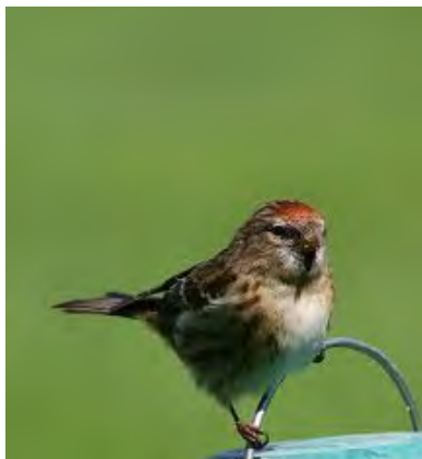
Lesser Redpoll R.S.P.B.

or email to redsquirrel@alnwickwildlifegroup.co.uk Copies of the monthly Newsletter and sightings will be made available on the web site one month after the paper publication.