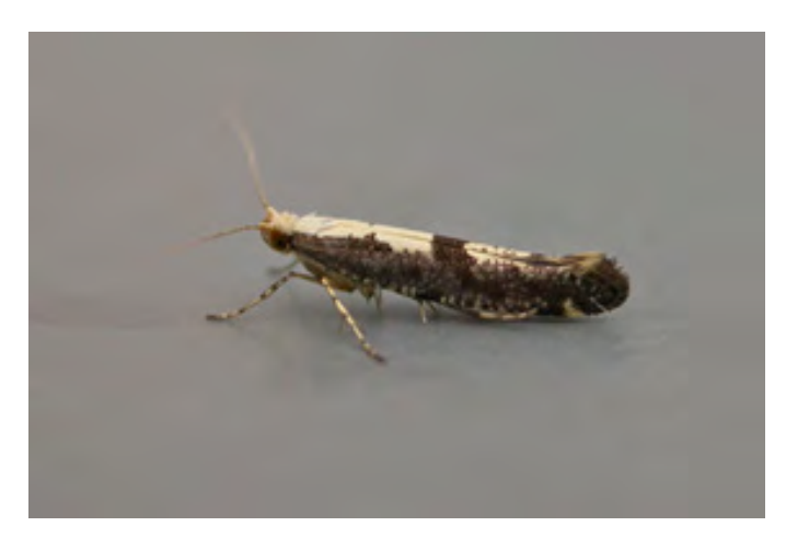
Argyresthia trifasciata (Wingspan 8-9 mm)