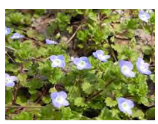
Common Field Speedwell