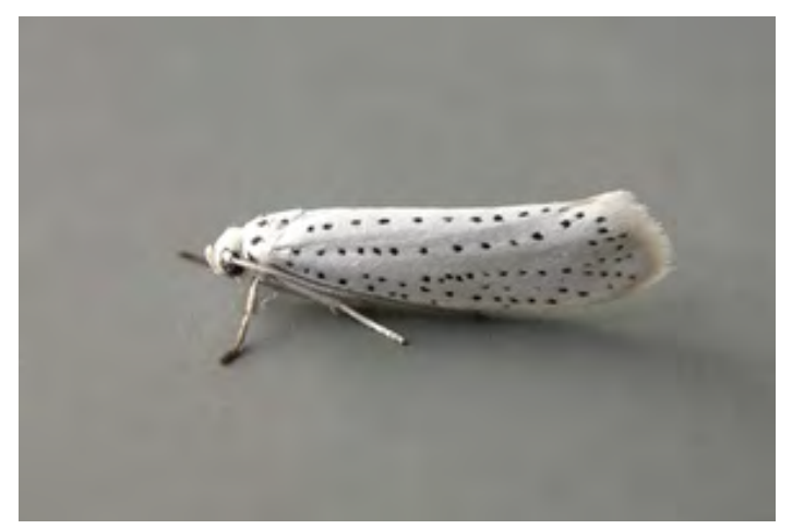
Yponomeuta evonymella (Wingspan 19-25 mm)

The Yponomeutinae is a smaller genera containing eight British species, six of which have been recorded from Northumberland. The adults are difficult to separate at species level, all having white wings with black spots and in some cases slight grey shading. The larvae mainly feed communally on the leaves of various trees in white 'tent' webs. Occasionally they make the news, since they can occur in hundreds of thousands and cover everything around in webs. The commonest species in Northumberland is Yponomeuta evonymella which feeds on Bird-cherry.