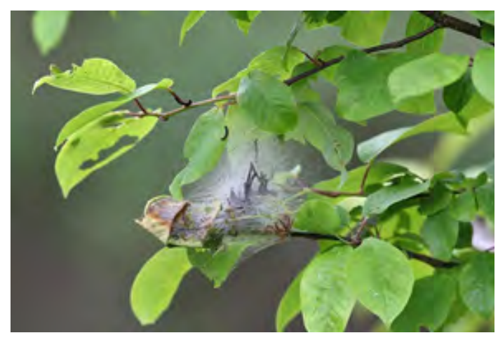
A small larval nest on Bird-cherry